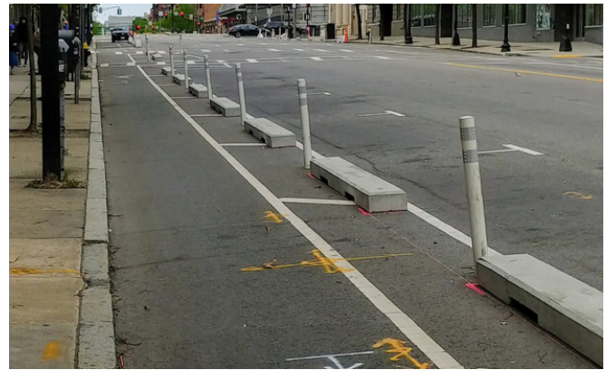
Combination of concrete wheel stops and delineators