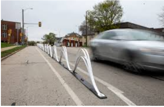
Aesthetic 8'l x 5'h x 2'w