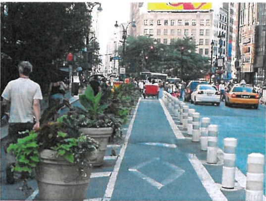
Bollards spaced at 5'