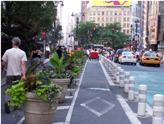
Bollards spaced at 5'