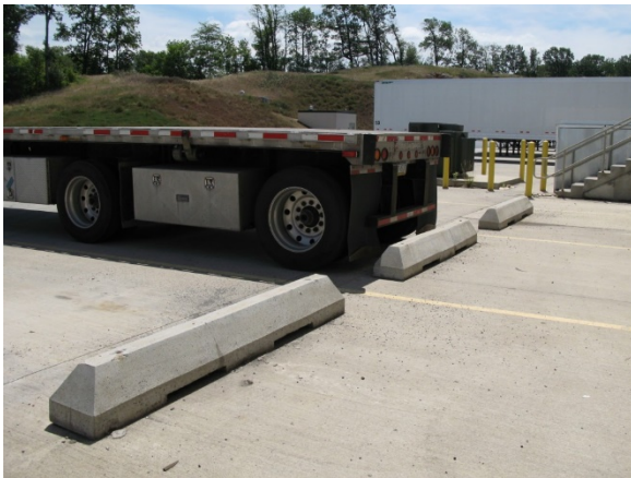
Pre-cast concrete truck wheel stop- painted 12” h x 8’ long w/4ft between

The following are only a few options.....there are a lot of different and good ideas out there but we need to narrow down the idea(s) and the direction to recommend to PW intern to Council.