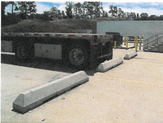
Pre-cast concrete truck wheel stop- painted 12" h x 8' long w/4ft between

The following are only a few options.....there are a lot of different and good ideas out there but we need to narrow down the idea(s) and the direction to recommend to PW intern to Council.