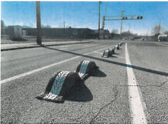
Recycled Tires 5' L x 10" H