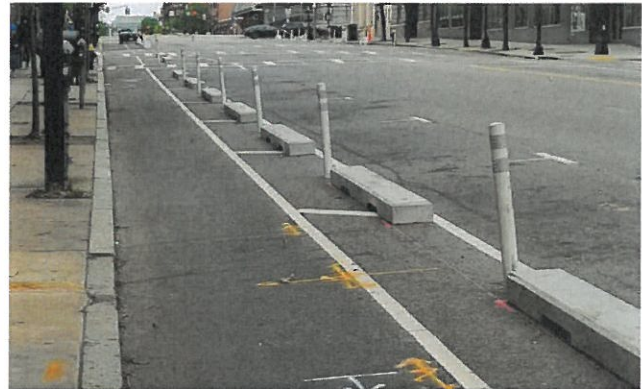
Combination of concrete wheel stops and delineators