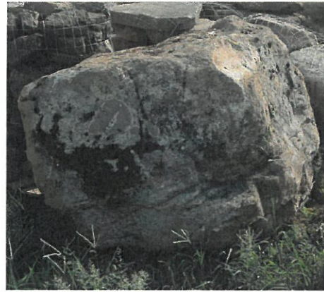
Boulders at 6ft oc