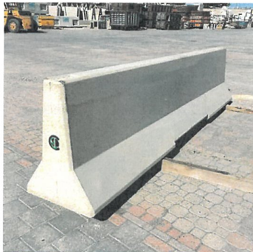
Jersey Barriers - option for art on the face 32" to 42" h