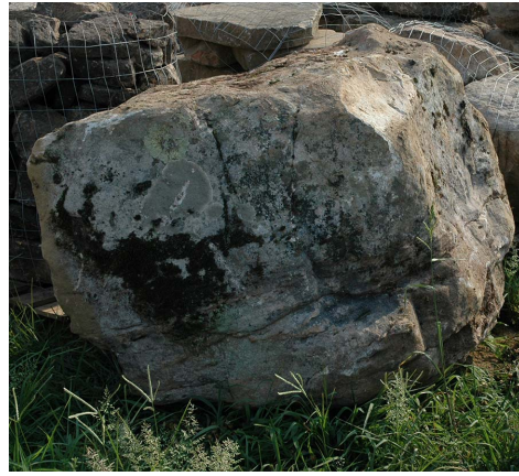
Boulders at 6ft oc