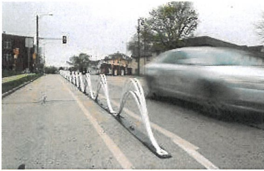
Aesthetic 8'l x 5'h x 2'w