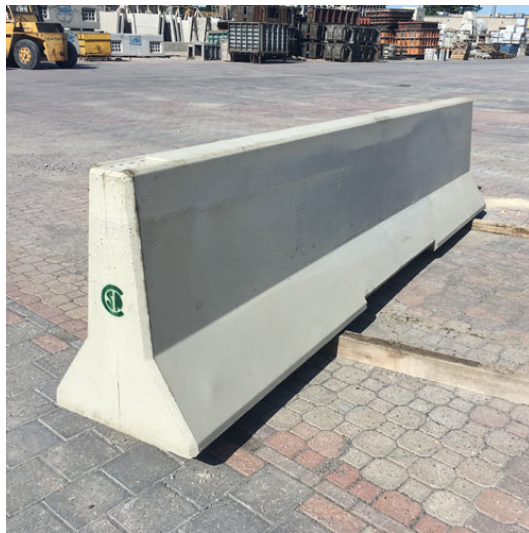
Jersey Barriers - option for art on the face 32” to 42” h