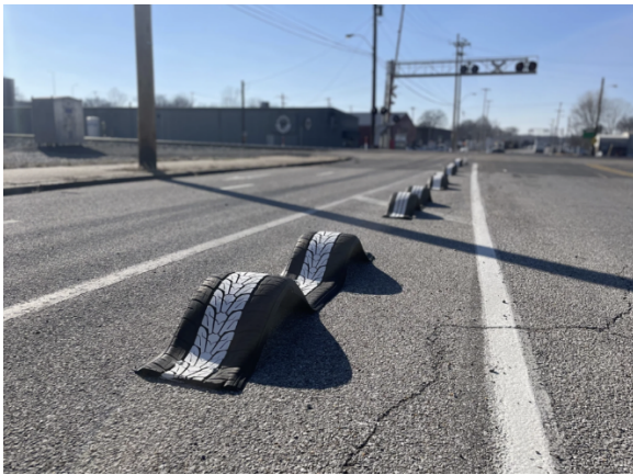
Recycled Tires 5' L x 10" H